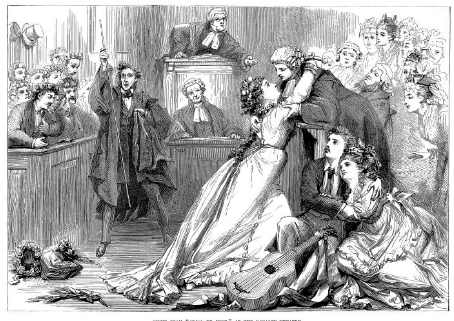
SCENE FROM "TRIAL BY JURY," AT THE ROYALTY THEATRE

Finally, why is there no mechanism by which high profile High Court cases like the Roadchef Esop, which affected hundreds of people directly and two thousand others indirectly, can be given urgent priority for accelerated court hearing? Why did it take so long for the proposed Roadchef compensation scheme to be validated finally by a High Court judge? Is anybody looking at this at the Department of Justice?